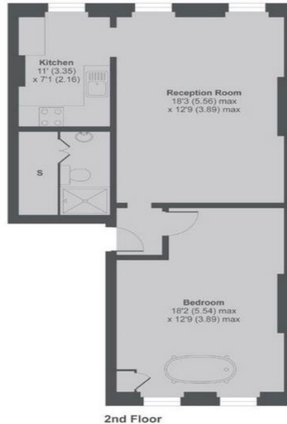
Stanley Gardens, W11 MAIN HOUSE APPROX FLOOR AREA 612 SQ.FT 56.8 SQ.M

Ideally located for the amenities of Notting Hill Gate Westbourne Grove and Portobello Road and fantastic transport links in and out of London.